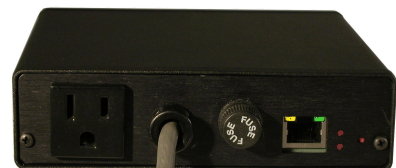
NPS-01 Rear View

The SPS-01 controls power using ASCII commands received through an RS232 interface. No configuration is required, however the dwell timer for a power cycle may be set. The SPS-01 echoes commands and provides status back to the controlling device so the remote operator knows if power to the controlled device is on or off.