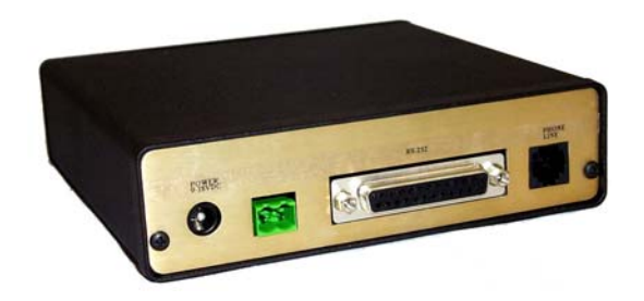
Rear view of D-Series modem