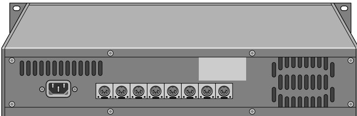
Rear View of DCB PS-8