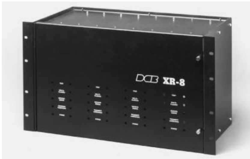
DCB XR-8 Modem Rack