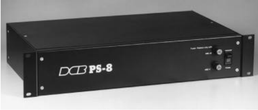
DCB PS-8 Rack Power Supply