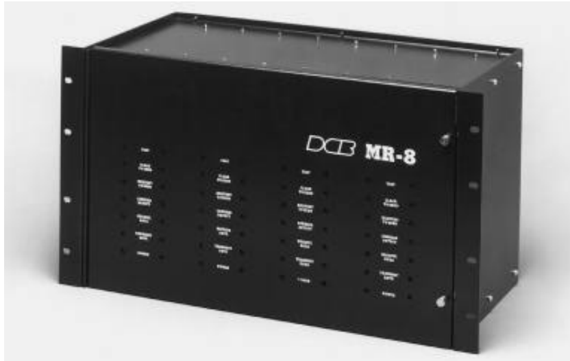
DCB MR-8 Modem Rack