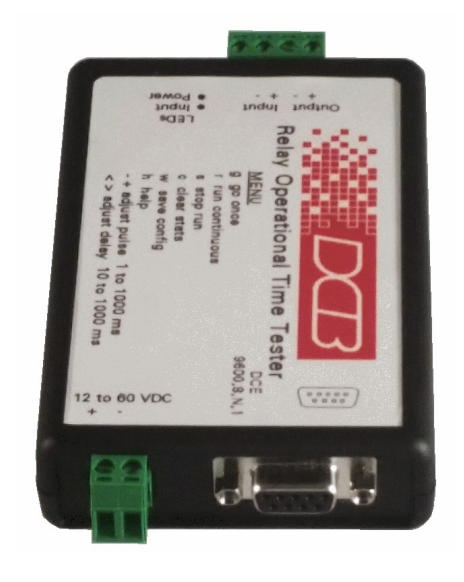
Power and Serial Control Port