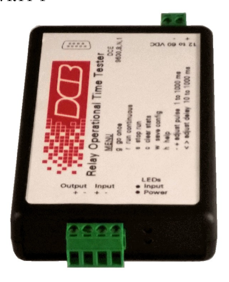
Relay Control I/O and Indicators